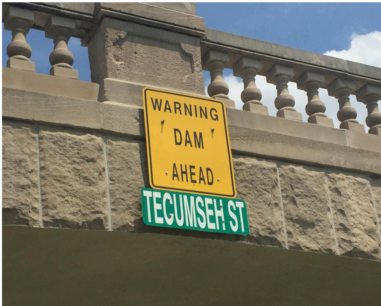
A current warning sign on the Tecumseh Street Bridge.